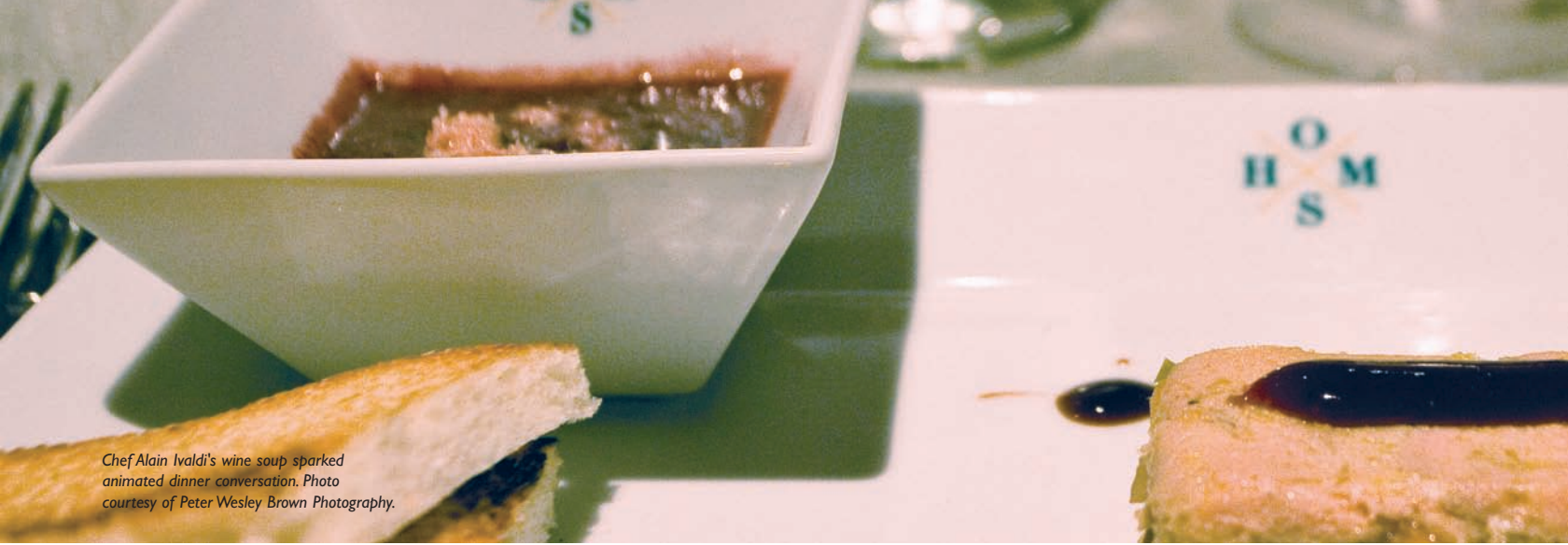
Chef Alain Ivaldi's wine soup sparked animated dinner conversation.